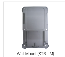
Wall Mount (STB-LM)